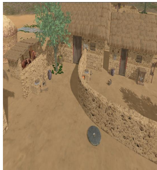
Figure 4. Scene of the Southern Courtyard

Speedtree is a professional modeling software that can create custom tree models. The tree models can be directly imported into Unity 3d by Speedtree for Unity plug-in. The scene lights can be set up after the building models and terrains were putted in the right position in Unity 3d. Unity 3d provides simple natural light source. To ensure that the brightness of the whole scene can't be too intensity, it is necessary to add a directional light source as the main light source of the scene. The light settings in the whole scene play an important role in the rendering of the later scene and the user experience [15]. Some scenes of the Qing Dynasty relics in Xinzheng are shown in Figure 4, Figure 5 and Figure 6.