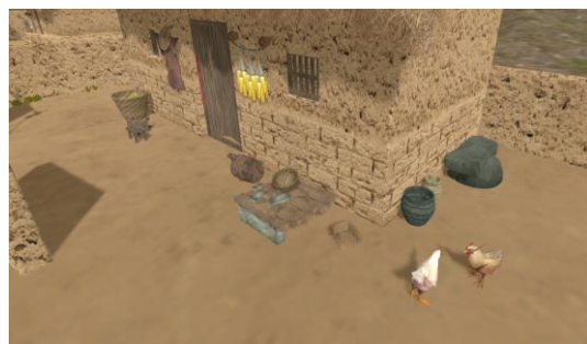
Figure 6. Details of some scenes