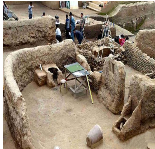
Figure 2. Courtyard ruins

courtyards of East and West were cleared out. Abundant building materials, farm implements, kitchenware, tableware, supplies and other relics were unearthed [11]. Some of the remains are shown in Figure 2, The remaining houses, walls and cooking ranges in the picture, including the chicken coop on the left side of the front door, can be seen clearly, which provides a basis for the restoration of the vestige scene.