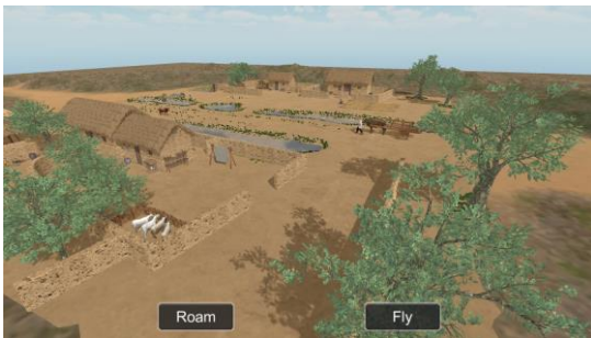
Figure 7. Interaction interface of scene

In this study, the interactive displaying interface of the relic restoration is developed based on NGUI plug-in which is the powerful UI component. Firstly, the NGUI plug-in is imported into the Unity 3d project. Secondly, interactive buttons are created according to the requirements. Finally, the C# script is created and the script is bound to canvas to write code to realize the interactive function. The interface is shown in Figure 7.