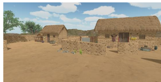
Figure 5. Scene of North Courtyard